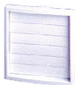
Grill on pressure